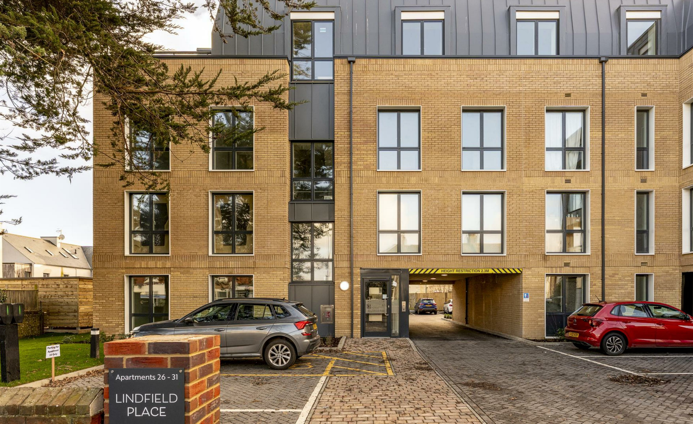
Lindfield Place, Worthing, BN11 2FQ Asking Price £297,500